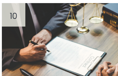
Contract to solicitor.