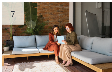
Receiving an offer.