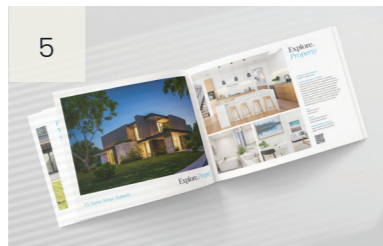
Marketing your property.