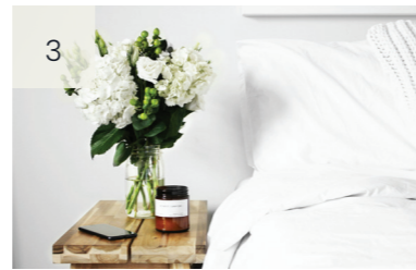
Presenting your property.